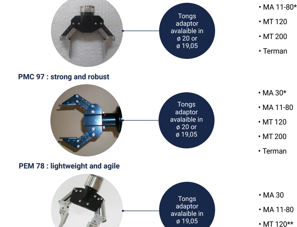
PGCL 2: powerful and resistant