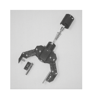
Tongs PMC 97 with disconnectable grippers

Adapted to all types of tongs, the parking fixture enables the tongs to be disconnected from the outside of the hot cell. This tool can also disconnect tongs grippers (disconnectable in hot cell option). A specific parking fixture is required when using a tongs extension.