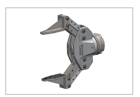
PGLC 2 • Weight 560 g