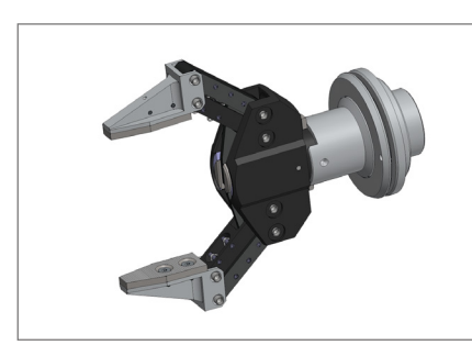
PM • W