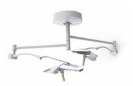
Dual Maquet Lucea 100: ceiling version