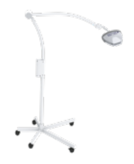
Maquet Lucea 40: mobile version