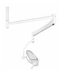
Maquet Lucea 50 DF: ceiling version