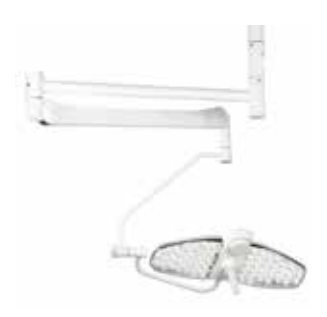
Maquet Lucea 100 DF: ceiling version