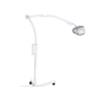
Maquet Lucea 40: ceiling version