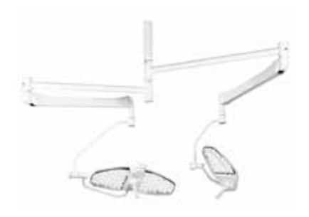
Dual Maquet Lucea 50/100 DF: ceiling version